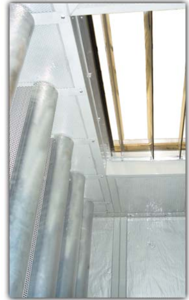
Sound attenuators shown in Recirc Air Handler